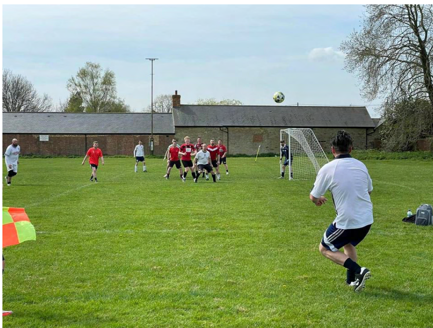
Action from last year's game.

Gretton Life is the Parish Council Newsletter. It is published three times a year, approximately every four months. We feature news and information about local organisations and events. To maintain transparency and avoid unfair promotion we can only include articles from charitable or not-for-profit organisations.